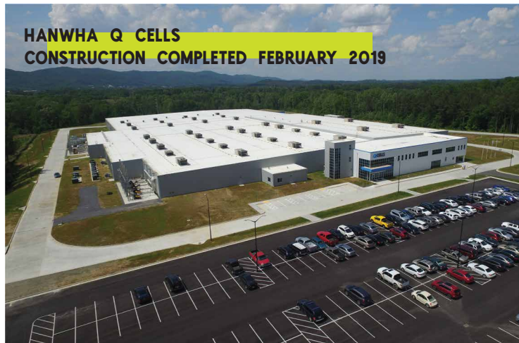
HANWHA Q CELLS CONSTRUCTION COMPLETED FEBRUARY 2019

UTILITIES: ALL UTILITIES AT PROPERTY DAILY EXCESS OF WATER: 40 MILLION GALLONS DAILY EXCESS OF SEWER: 20 MILLION GALLONS