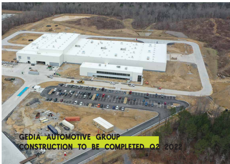
GEDIA AUTOMOTIVE GROUP CONSTRUCTION TO BE COMPLETED Q2 2022